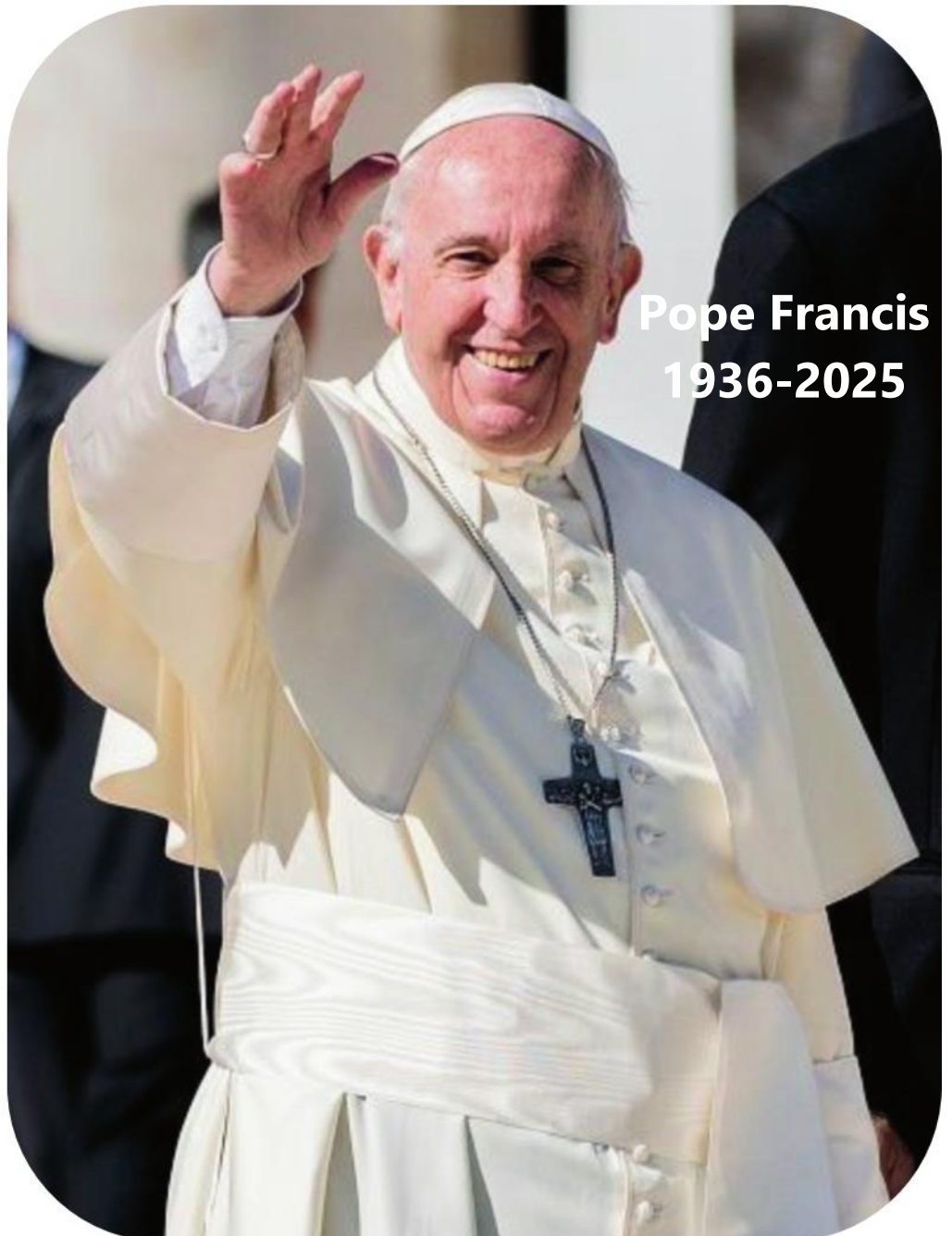
Pope Francis 1936-2025

5401 N. Main Street Dayton, OH 45415 937.278.5815