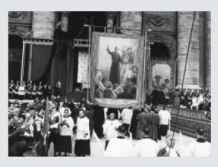
St. Gaspar's canonization in 1954.

St. Gaspar, apostle of the Precious Blood, pray for us!