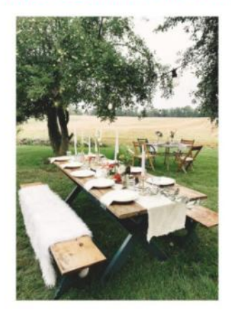
Come celebrate summer at the Garden!

At St. Paul's Parish (near the creek), 1000 W Wenger Rd. Thursday, July 13th, 7 -8:30 p.m.