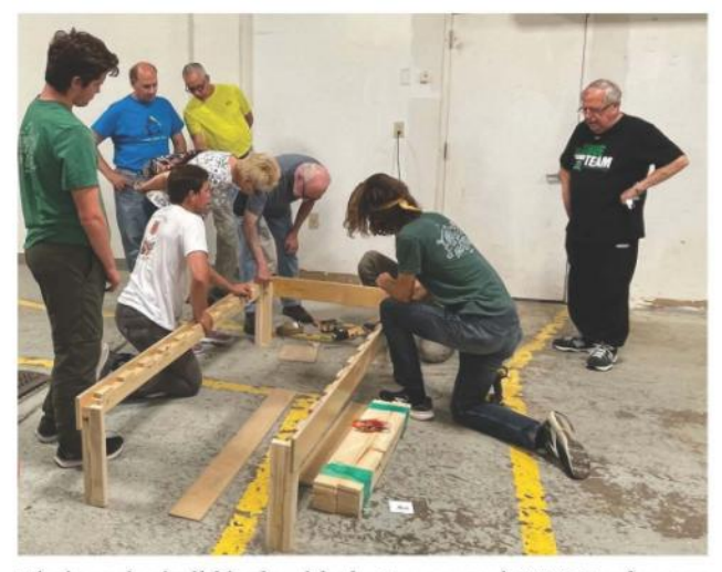
Missionaries build beds with the Emmanuel SVDP Conference.