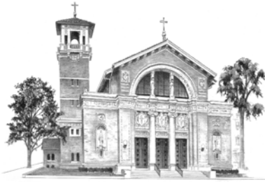
St. Joseph Church 1847