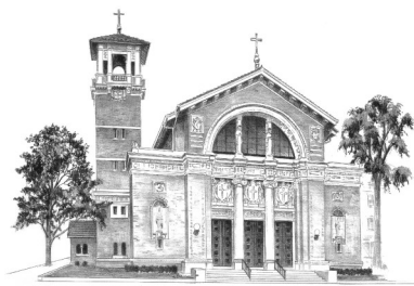
St. Joseph Church 1847