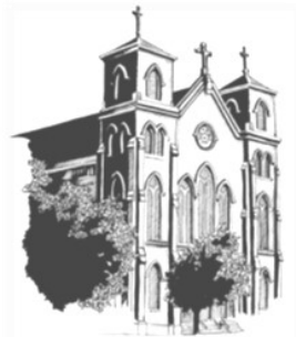
Emmanuel Church 1837