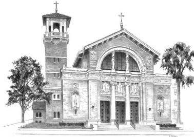
St. Joseph Church 1847